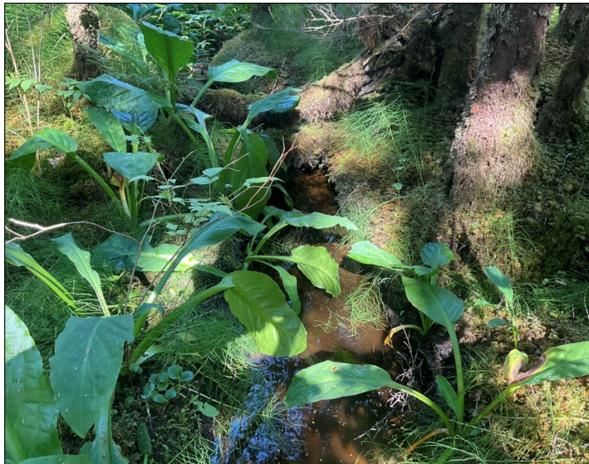
Figure 3.–Looking downstream at waypoint 1149.