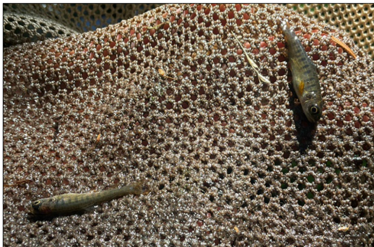
Figure 1.–Juvenile coho salmon caught at waypoint 1146.