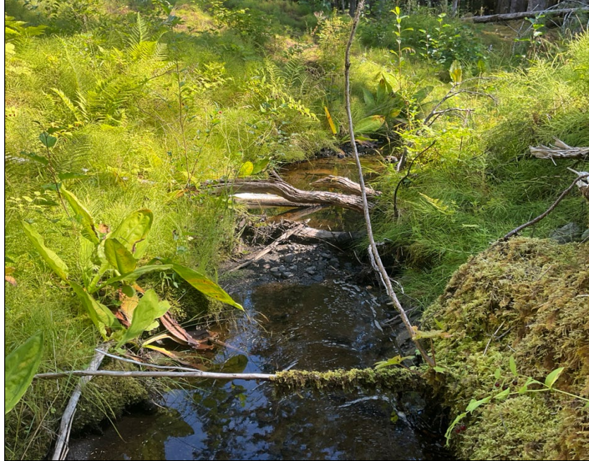
Figure 2.–Looking upstream at waypoint 1146.